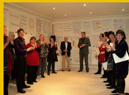
2011 Trainer Training, Auckland